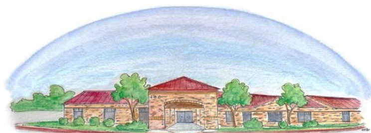
Spring Hill Elementary School Fayetteville, Georgia

What are the dismissal procedures at your school? Details located in substitute folder